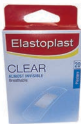
ELASTOPLAST CLEAR STRIP 20 PRODUCT CODE: 82887