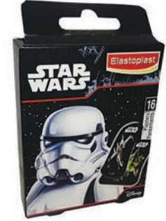
ELASTOPLAST STAR WARS STRIPS ASSORT 16 PRODUCT CODE: 85692