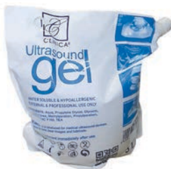
ULTRASOUND GEL CLEAR 5000ML CLINICA PRODUCT CODE: 56482