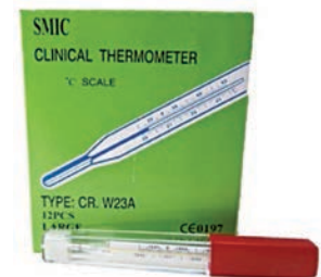
RIKI CLINICAL THERMOMETER 12 PER BOX PRODUCT CODE: 88613