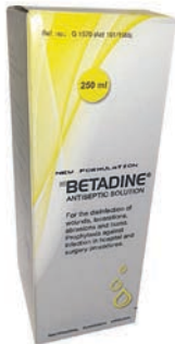
BETADINE ANTISEPTIC SOL 250ML- PRODUCT CODE: 82057