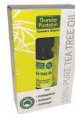
TEA TREE OIL 10ML PRODUCT CODE: 53784