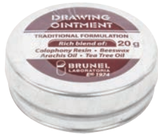
DRAWING OINTMENT 20G PRODUCT CODE: 83710