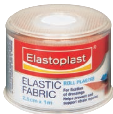
ELASTOPLAST FAB ROLL 2.5CM X 1M PRODUCT CODE: 82869