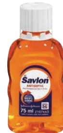
SAVLON LIQUID SOL DISINFECTANT 75ML PRODUCT CODE: 11903