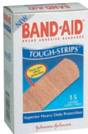
BAND AID TOUGH STRIPS 15 PRODUCT CODE: 83045