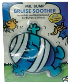
MEDIRITE BUMP BRUISE -TRTC- SOOTH SACH PRODUCT CODE: 56115