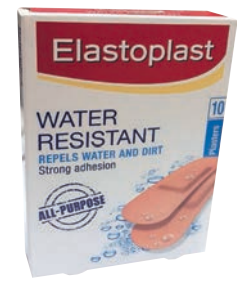
ELASTOPLAST WATER RESISTANT 10 PRODUCT CODE: 82880