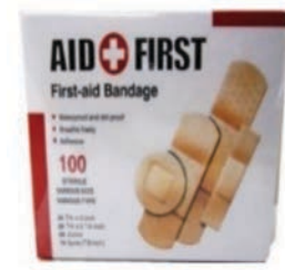
RIKI FIRST AID PLASTER 100 PIECES PRODUCT CODE: 88697