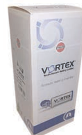
VORTEX SPACER BABY WITH MASK LADY BUG PRODUCT CODE: 82625