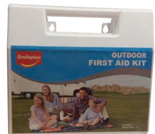
RIKI FIRST AID CAR KIT 260X30M- PRODUCT CODE: 86514