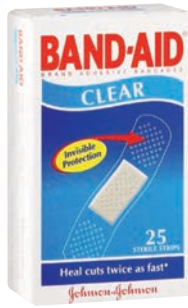
BAND AID CLEAR STRIPS 25 PRODUCT CODE: 21512