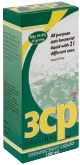
3CP 333 DISINFECTANT 100ML PRODUCT CODE: 57401