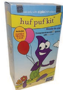
CIPLA-HUF-PUF KIT DEVICE 1 PRODUCT CODE: 61726