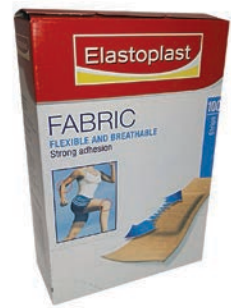
ELASTOPLAST FABRIC STRIP 100 PRODUCT CODE: 82874