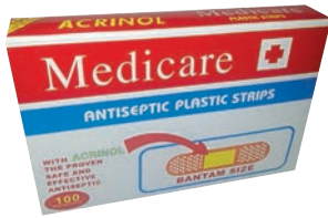
RIKI PLASTERS 100 PER BOX PRODUCT CODE: 86506