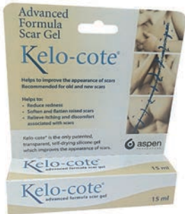
KELO-COTE GEL 15G PRODUCT CODE: 67205