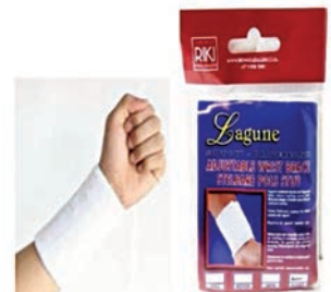
RIKI WRIST SUPPORT SMALL PRODUCT CODE: 88637