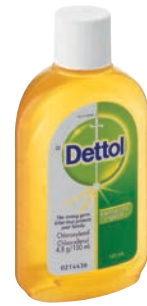
DETTOL 125ML SOLUTION PRODUCT CODE: 80436