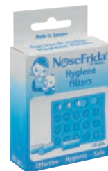
NOSEFRIDA FILTERS 20 NF002 PRODUCT CODE: 49836