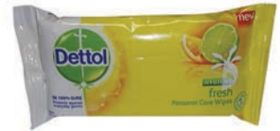
DETTOL HYGIENE WIPES FRESH 10 PRODUCT CODE: 85879