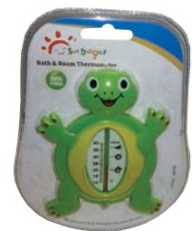
RIKI BATHROOM THERMOMETER PRODUCT CODE: 82405