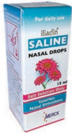
ILIADIN SALINE 15ML NASAL DROPS PRODUCT CODE: 39126