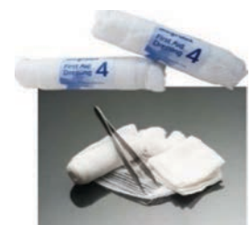
RIKI FIRST AID DRESSING BAND SIZE 4 10 PRODUCT CODE: 88651