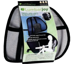
LUMBER JOY PRODUCT CODE: 57385