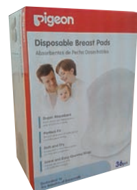
PIGEON BREAST PADS 36 PRODUCT CODE: 54074