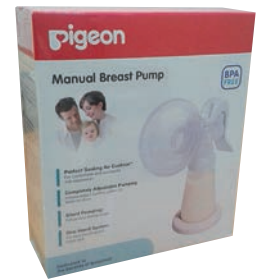
LANSINOH BREAST PUMP MANUAL PRODUCT CODE: 54794