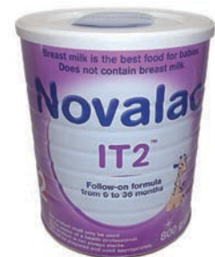
NOVALAC IT2 800G PRODUCT CODE: 72002