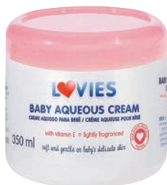
AQUEOUS CREAM LIGHT SCENTED LOVIES 350ML PRODUCT CODE: 87173