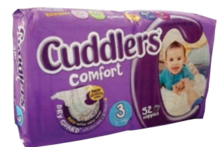
CUDDLERS COMFORT VP SIZE3 52 PRODUCT CODE: 84389