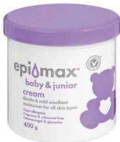
EPI-MAX BABY & JUNIOR CREAM 400G PRODUCT CODE: 48029