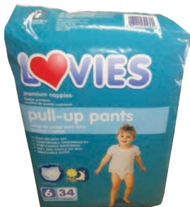
DIAPERS PULL UP PANTS 6 LOVIES 34 PRODUCT CODE: 87161