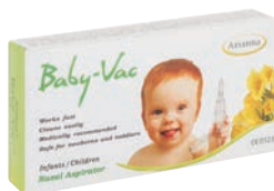
BABY-VAC NASAL SECRETION ASPIRATOR PRODUCT CODE: 46431