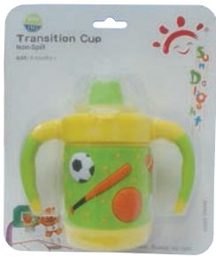
RIKI TRANSITION CUP NON SPILL PRODUCT CODE: 82163