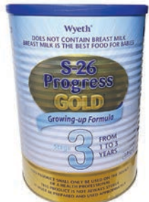
S-26 PROGRES GOLD 3 INFAN 1.8KG 1-3YRS PRODUCT CODE: 82551