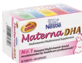
NESTLE MATERNA DHA 30+30 CAPS PRODUCT CODE: 81469