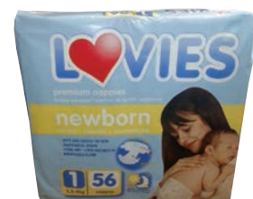
DIAPERS NEWBORN LOVIES VP 56 PRODUCT CODE: 87160