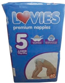
DIAPERS JUNIOR LOVIES VP 40 PRODUCT CODE: 87158