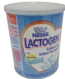
LACTOGEN 2 POWDER 400G PRODUCT CODE: 67237