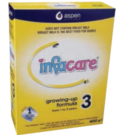
ASPEN INFACARE 3 PWD 400G PRODUCT CODE: 70983