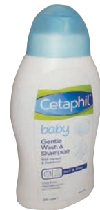
SHPOO CETAPHIL BABY GENTLE WASH 300ML PRODUCT CODE: 84772