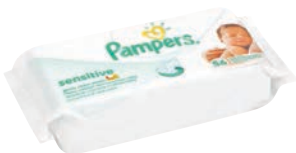
PAMPERS BABY WIPES SENSITIVE 56 PRODUCT CODE: 81097