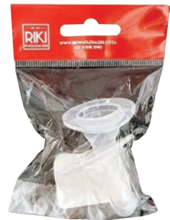
RIKI SILICONE TEATS 2 PRODUCT CODE: 82395