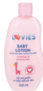
BABY LOTION LOVIES 200ML BOTTLE PRODUCT CODE: 87178