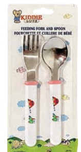
RIKI TRAINING SPOON & FORK PRODUCT CODE: 82411