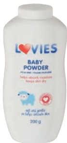
BABY POWDER LOVIES 200G PRODUCT CODE: 87181