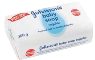
J&J BABY BATH BEDTIME 300ML PRODUCT CODE: 72795