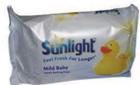
SUNLIGHT SOAP MILD BABY 100G PRODUCT CODE: 87687