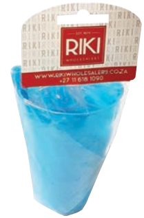
RIKI MUG WITH STRAW PRODUCT CODE: 82401