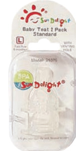
RIKI SILICONE NIPPLE LARGE 2 PRODUCT CODE: 82407