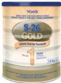
S-26 GOLD 1 INFAN FORMU 1.8KG 0-6 MTHS PRODUCT CODE: 82553