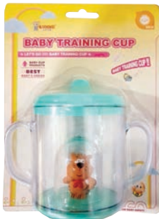
RIKI BABY CUP PRODUCT CODE: 82438