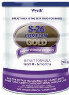
S-26 COMFORT GOLD 900G BIRTH-6MNTHS PRODUCT CODE: 71812