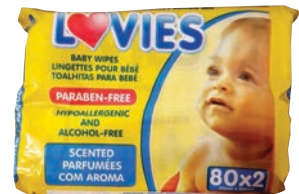
BABY WIPES SCENTED LOVIES 2X80 PRODUCT CODE: 87168