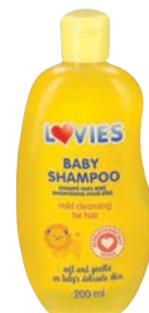
SHPOO BABY LOVIES 200ML BOTTLE PRODUCT CODE: 87175