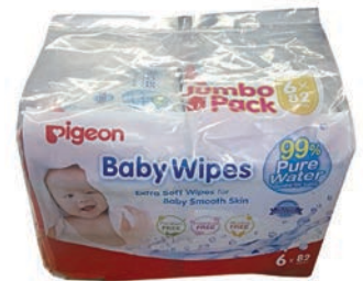
PIGEON BABY WIPE6IN1 6 PRODUCT CODE: 54793