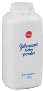
J&J BABY POWDER 100G PRODUCT CODE: 3628