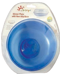
RIKI BOWL WITH COVER PRODUCT CODE: 82418