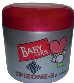
EPIZONE E OINT 500ML BABY AND KIDS PRODUCT CODE: 85721