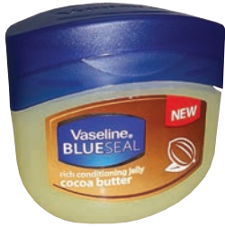
VASELINE COCOA BUTTER PETRO JELLY 100ML PRODUCT CODE: 60643