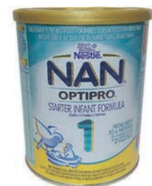
NAN 1 OPTIPRO PROTECT STARTER 400G PWD PRODUCT CODE: 81683