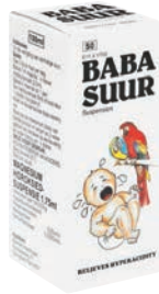
BABA SUUR 100ML PRODUCT CODE: 68998