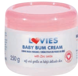
BABY CREAM BUM LOVIES 250G TUB PRODUCT CODE: 87171