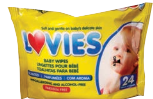
BABY WIPES SCENTED LOVIES 24 PRODUCT CODE: 87165