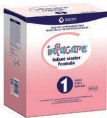
ASPEN INFACARE 1 PWD 400G PRODUCT CODE: 67217