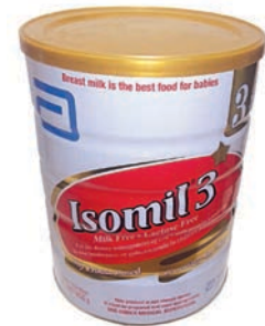
ISOMIL 3 POWDER 850G ABBOT PRODUCT CODE: 80463