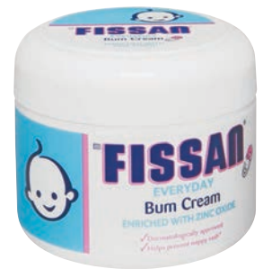
FISSAN BABY BUM CREAM 250G PRODUCT CODE: 81994