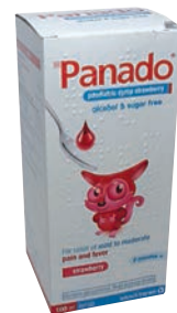
PANADO PAED SYRUP 100ML STRAWBERRY PRODUCT CODE: 35625