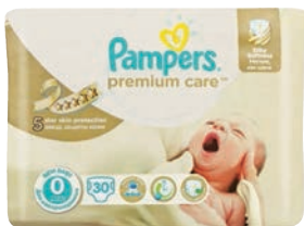
PAMPERS PREMIUM CARE PREMATURE 30 PRODUCT CODE: 72025