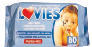
BABY WIPES UNSCENTED LOVIES 80 PRODUCT CODE: 87170