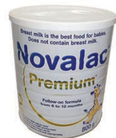
NOVALAC PREMIUM 2 800G PRODUCT CODE: 73111