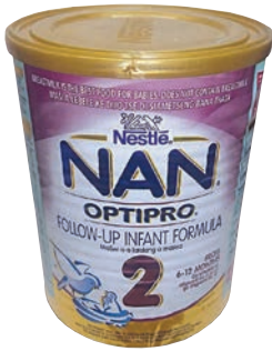
NAN 2 OPTIPRO PROTECT+ 900G POWDER PRODUCT CODE: 67243