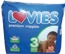
DIAPERS MIDI LOVIES 10 PRODUCT CODE: 87155