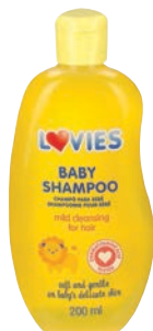
SHPOO BABY LOVIES 200ML BOTTLE PRODUCT CODE: 87175