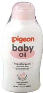
PIGEON BABY OIL 200 PRODUCT CODE: 54998