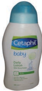
CETAPHIL BABY DAILY LOTION 300ML PRODUCT CODE: 84773