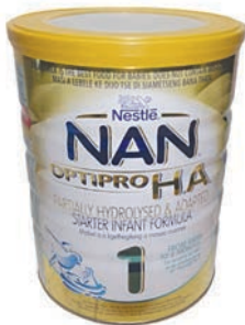
NAN HA 1 POWDER 800G PRODUCT CODE: 72127