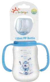
RIKI BABY FEEDING BOTTLE 130ML W/HANDLE PRODUCT CODE: 82164