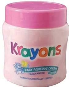
KRAYONS AQUEOUS CREAM 300ML PRODUCT CODE: 82299