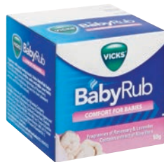
VICKS BABY RUB 50G PRODUCT CODE: 84316