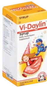
VI-DAYLIN SYRUP 150ML PRODUCT CODE: 14174