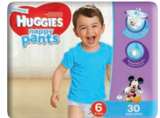
HUGGIES PANTS BOYS SIZE 6-30 PRODUCT CODE: 86799