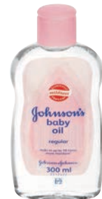
J&J BABY OIL 300ML PRODUCT CODE: 42593