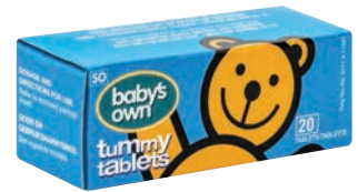
J&J BABYS OWN TUMMY TABS 20 PRODUCT CODE: 47046