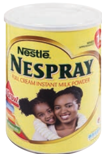
NESPRAY POWDER 1800G NESTLE PRODUCT CODE: 73807