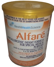
ALFAMINO ACS001 400G PRODUCT CODE: 67234