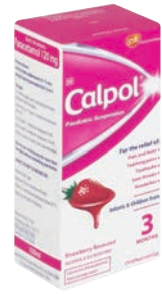
CALPOL PAED ORIG 100ML SYRUP PRODUCT CODE: 4425