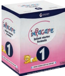
ASPEN INFACARE 1 PWD 1.8KG PRODUCT CODE: 74081