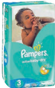
PAMPERS ACT BABY MIDI 58 NO3 4-9KG PRODUCT CODE: 81083