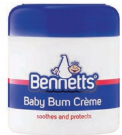
BABY BUM CREME 300G BENNETTS PRODUCT CODE: 68154