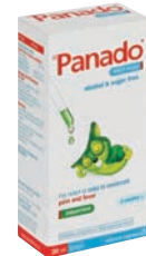
PANADO INFANT DROPS 20ML PRODUCT CODE: 10370