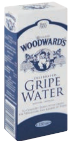
WOODWARD GRIPE WATER 150ML PRODUCT CODE: 20470