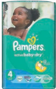
PAMPERS ACT BABY MAXI 50 NO4 7-14KG PRODUCT CODE: 74057