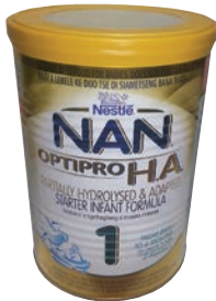
NAN HA 1 POWDER 400G PRODUCT CODE: 72126