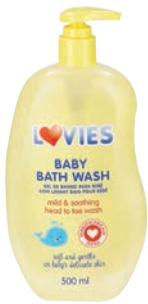
BABY WASH LOVIES 500ML BOT WITH PUMP PRODUCT CODE: 87174