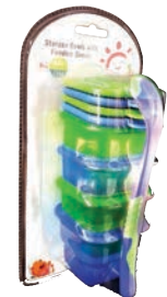
RIKI STORAGE BOWL & SPOON PRODUCT CODE: 82417