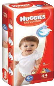
HUGGIES DRY COMFORT 4 PLUS 44 PRODUCT CODE: 82783