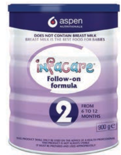
ASPEN INFACARE 2 PWD 900G PRODUCT CODE: 72004