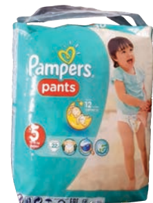
PAMPERS ACT B/PANT JNR C/P 22 NO5 12-18 PRODUCT CODE: 82604