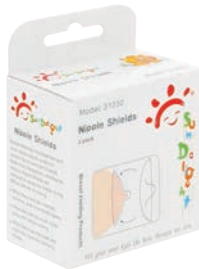
RIKI NIPPLE SHIELD 2 PRODUCT CODE: 82086