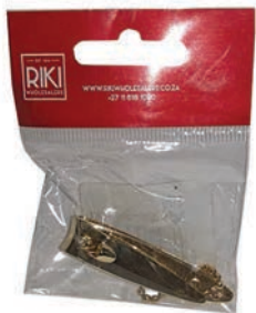
RIKI NAIL CLIPPER SMALL GOLD PRODUCT CODE: 84313