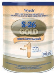
S-26 GOLD 1 900G INFANT FORMULA PRODUCT CODE: 58110