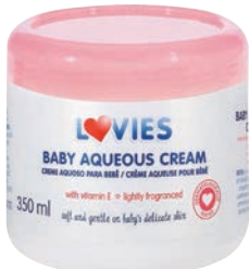
PIGEON BABY AQUEOUS CREAM LIGHT SCENTED LOVIES 350ML PRODUCT CODE: 87173