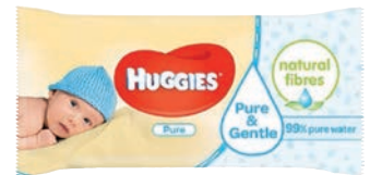
HUGGIES WIPES PURE 56 PRODUCT CODE: 87562