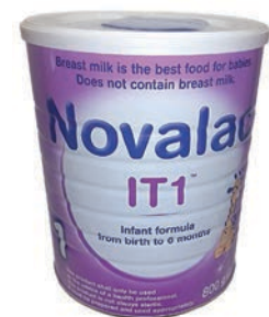
NOVALAC IT1 800G PRODUCT CODE: 72110