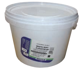
VASELINE WHITE 5KG 1 MEDICOLAB PRODUCT CODE: 34745