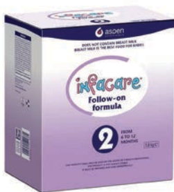
ASPEN INFACARE 2 POWDER 1800G PRODUCT CODE: 77087