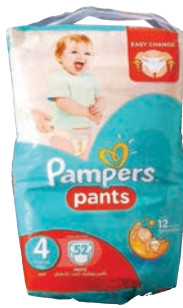
PAMPERS ACT B/PANT MAX JUMB 52 NO4 9-14K PRODUCT CODE: 82606