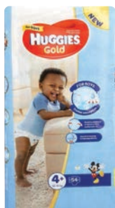
HUGGIES GOLD BOYS SIZE 4+ 54 PRODUCT CODE: 86790