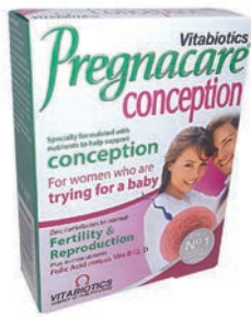
PREGNACARE CONCEPTION TAB 30 PRODUCT CODE: 81530