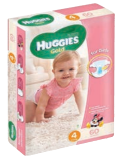
HUGGIES GOLD GIRLS SIZE 4-60 PRODUCT CODE: 86793