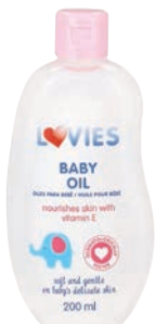
BABY OIL LOVIES 200ML BOTTLE PRODUCT CODE: 87172