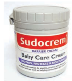
SUDOCREM 125G PRODUCT CODE: 58783