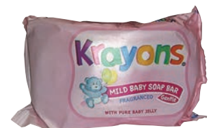
BABY SOAP KRAYONS MILD 100G PRODUCT CODE: 70851