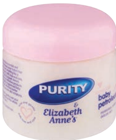
ELIZ ANN BABY PETROL JELLY ESSENTI 325ML PRODUCT CODE: 88108