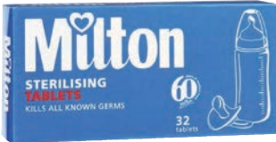
MILTON 32 TABLETS PRODUCT CODE: 69567