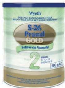
S-26 PROMIL GOLD 2 900G INFANT FORMULA PRODUCT CODE: 63852