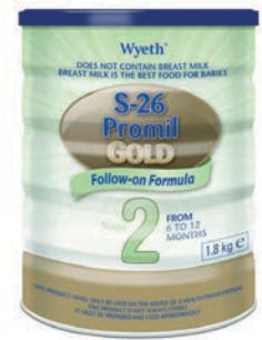
S-26 PROMIL GOLD 2 INFAN 1.8KG 6-12MTHS PRODUCT CODE: 82552