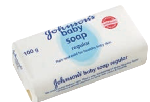
BABY SOAP REGULAR J&J 100G PRODUCT CODE: 47030