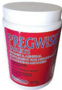
PREGWISE TAB 1000 PRODUCT CODE: 41194