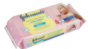
J&J BABY WIPES EXTRA SENSITIVE 72 PRODUCT CODE: 84700