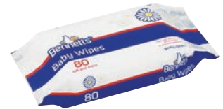
BABY WIPES 80 BENNETT PRODUCT CODE: 68171